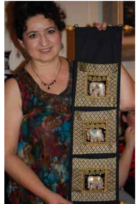
White Elephants at the gift exchange