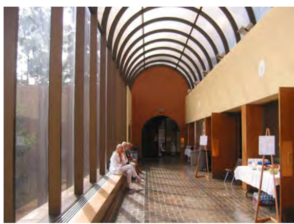
All EoE 2010 events and sessions will be held at the Salinas Community Center and the adjoining Sherwood Hall.