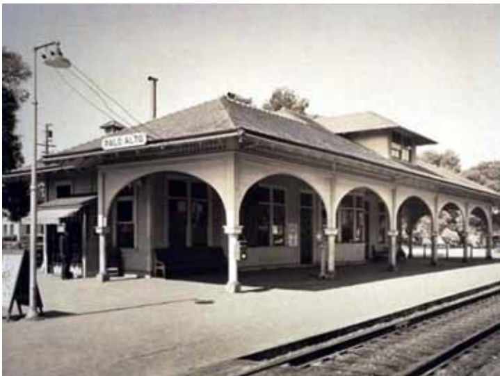
Ghost of the Palo Alto train station

He chose a seat by the window. The sun hit the glass and reflected his image. His hair was short. Of course! He came to San Jose because his stylist worked here on Tuesdays, Stevie's day off. He scanned his faded reflection in the train window to study his newly shorn head. His stylist said that his Bon Jovi do brought his chiseled face to the front. But as the train moved, he couldn't see his reflection properly, so he looked beyond his reflection, and saw a day clean and fresh after last night's storm. Right now, he needed a distraction from his problems, so he looked closer at the vision outside.