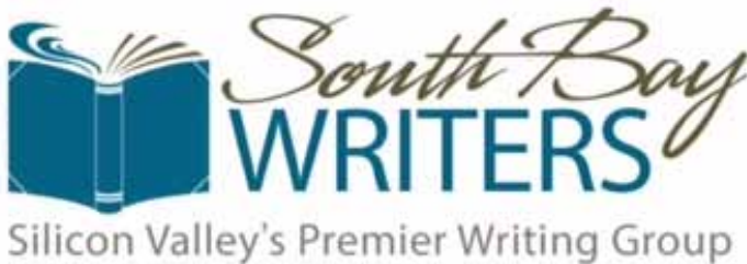
South Bay Writers New Logo, 2017

California Writers Club South Bay Branch www.southbaywriters.com