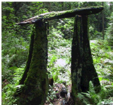
The nature of pi

Please send information on contests, conferences, and workshops to newsletter@southbaywriters.com . – WT