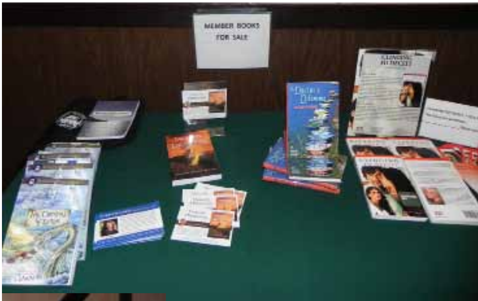
Above: Members Books for sale