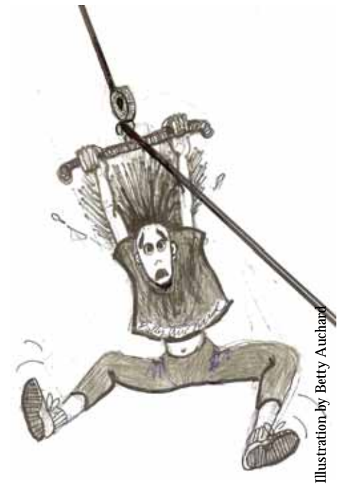
Illustration by Betty Auchard