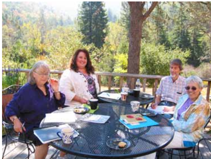
SBW Planning Retreat September 6

merit and cost, will come the selection and implementation. So, as resources accumulate and timing is right, you can bet your epilog, things will happen. We are an active club. We have all that it takes to broaden our opportunities, and we mean to do that.