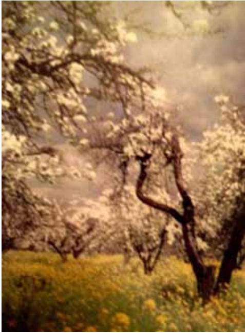
Blossoms and Mustard