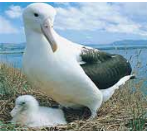
Albatross Mother and Chick

( Wisdom is a 63-year-old Laysan albatross believed to be the oldest wild bird in the world. Her latest chick hatched at the Midway Atoll National Wildlife Refuge near Hawaii. Experts believe the bird could have raised as many as 35 chicks in her life.)