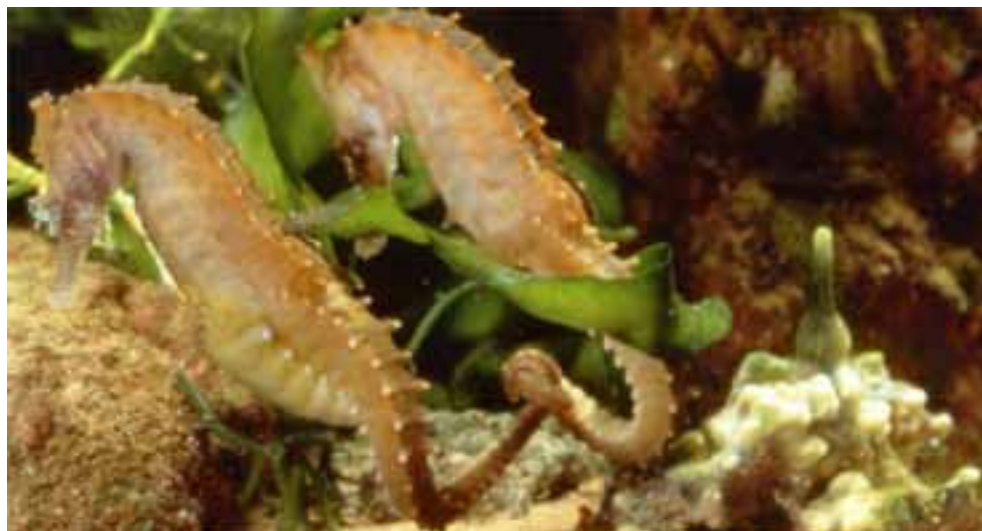
Seahorses in Love