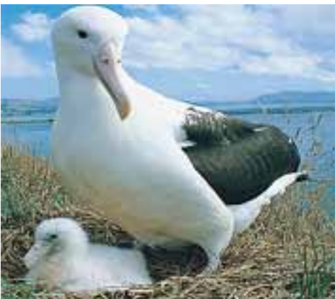
Albatross Mother and Chick

( Wisdom is a 63-year-old Laysan albatross believed to be the oldest wild bird in the world. Her latest chick hatched at the Midway Atoll National Wildlife Refuge near Hawaii. Experts believe the bird could have raised as many as 35 chicks in her life.)