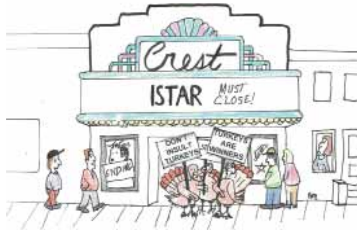
They're offended by flops being called 'turkeys.'

Bar protocol is like men's room urinal protocol: you don't look at the guy next to you for no good reason, but I felt compelled to see who would be ordering a martini at ten-thirty at night. I turned to find myself staring directly at the plaid flannel shoulder of