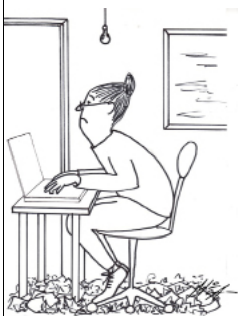
The Writer A lifetime of solitary silence in pursuit of communication.