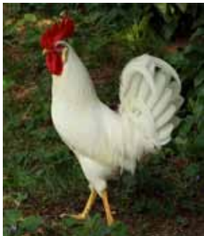
White Leghorn Rooster