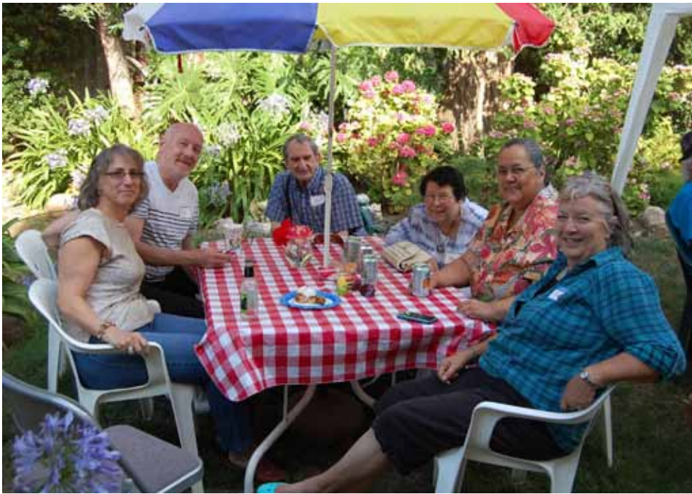
South Bay Writers Summer BBQ, July 12